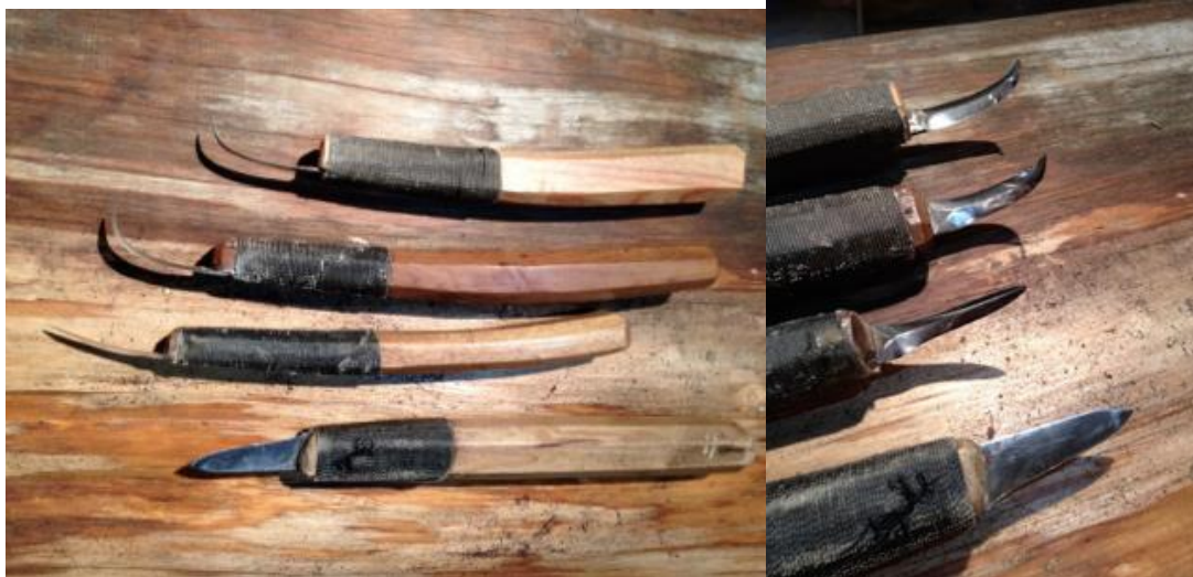
Bent knives (three different curved blades and a straight knife)