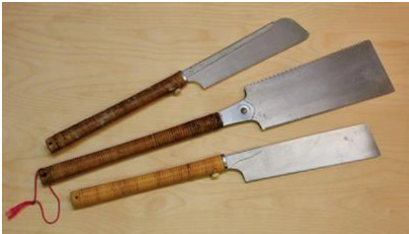
Japanese Saw or something similar can be handy