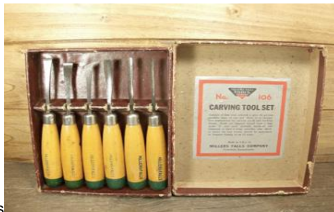
Set of small chisels and gouges