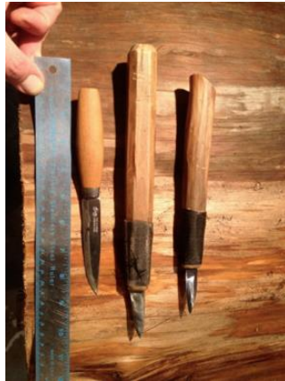
Basic carving knife