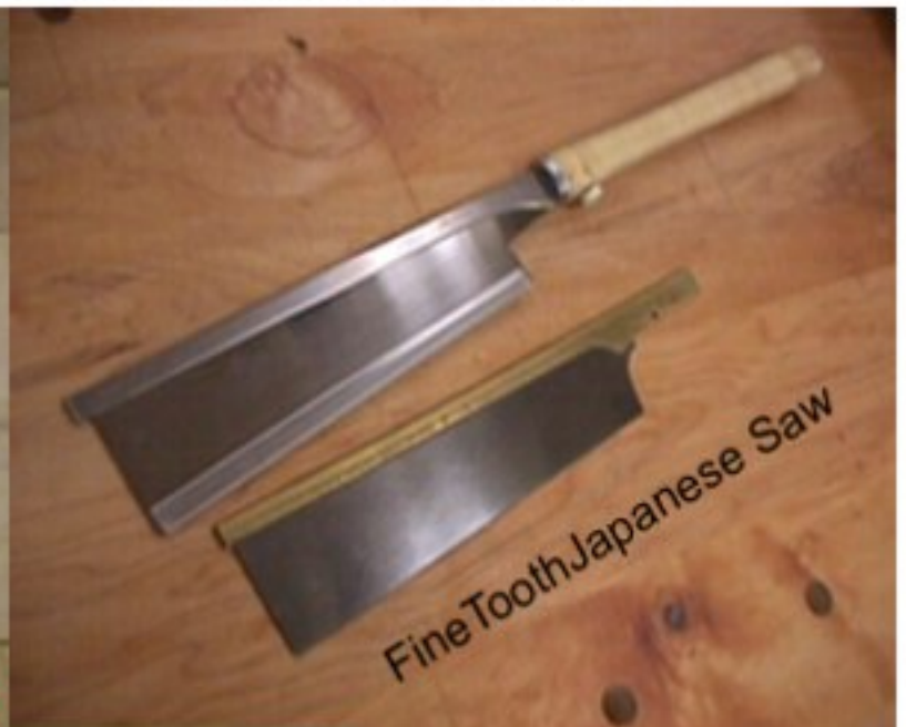
Fine Tooth Japanese Saw