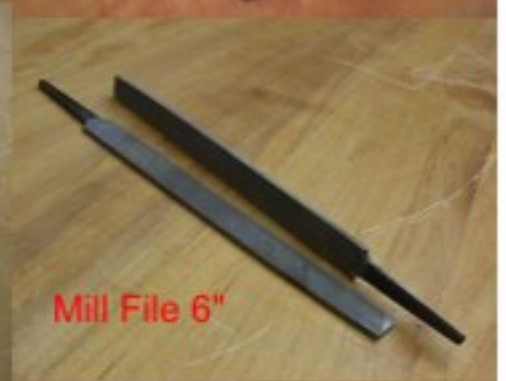
Mill File 6"