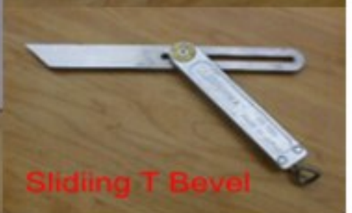
Sliding T Bevel