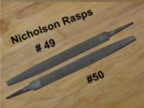
Nicholson Rasps # 49